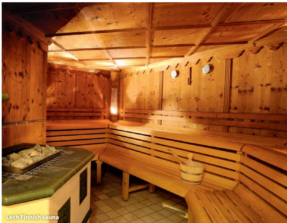
Lech Finnish sauna