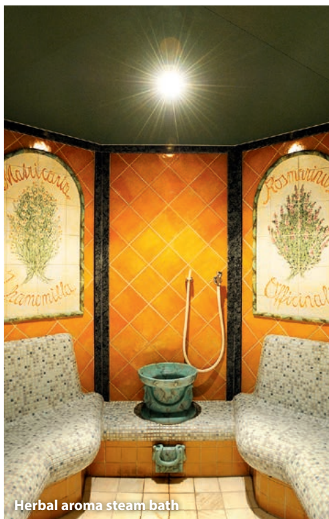
Herbal aroma steam bath