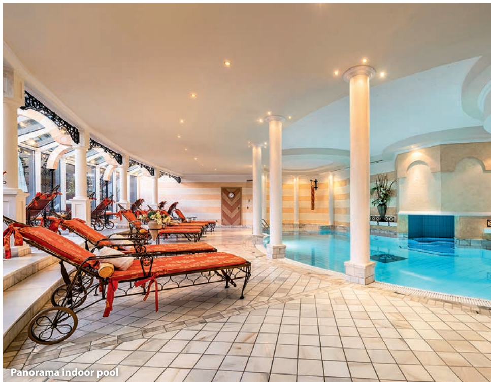
Panorama indoor pool