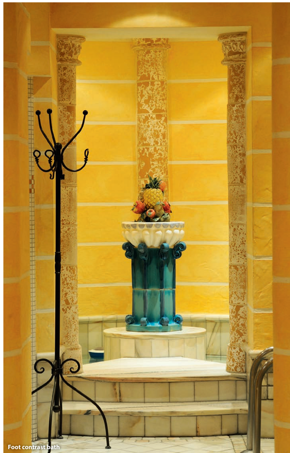
Foot contrast bath